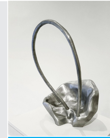
2018 Jury's Special Mention

He was born in Belgrade (Serbia) in 1971. He graduated in Sculpture at the University of Applied Arts in Belgrade. In 2000 he became a member of the artistic committee ULUPUDUS. His art is performed mainly in cast aluminum, and as a transient material uses styrofoam which prevents him from being too descriptive. Besides being developing his own art poetry through sculptures, he's also specialized in making theater props. He has had solo exhibitions and participated in group exhibitions in his country and abroad.