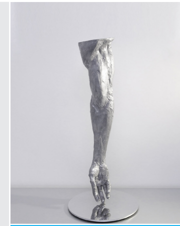
2017 Jury's Special Mention

Born in 1966, lives in Bernalda, province of Matera (Italy) where he works for a company that deals with extrusion of aluminum alloys. Artist-craftsman, former coachbuilder with a long experience in metals, he has been devoting himself to the processing of aluminum in creative recycling for several years. He started after taking possession of an aluminum block discarded in the company, turning it into a two-meter high crucifix. He has exhibited in several Italian cities and Spain. He considers the artistic experience mainly as an adventure of the mind and a search for harmony.