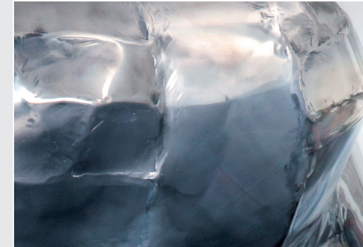
COMEL AWARD 2017 'SINUOSITY OF ALUMINIUM' Winner: Rosaria Iazzetta (Italy) - Senza titolo (detail)