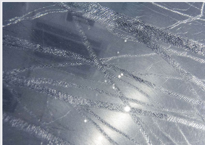
COMEL AWARD 2012 'BETWEEN HEART AND REASON' Winner: Massimiliano Drisaldi (Italy) - Inverno (detail)