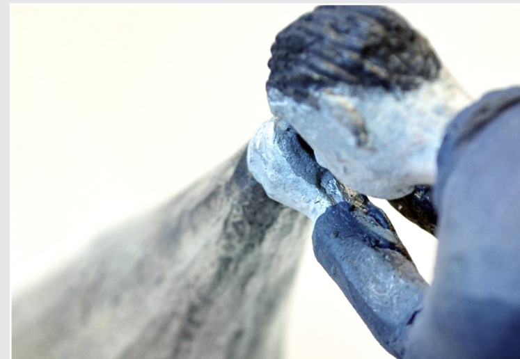
COMEL AWARD 2014 'TRANSFORMING ALUMINIUM' Winner: Pino Deodato (Italy) - Colui che vede lontano (detail)